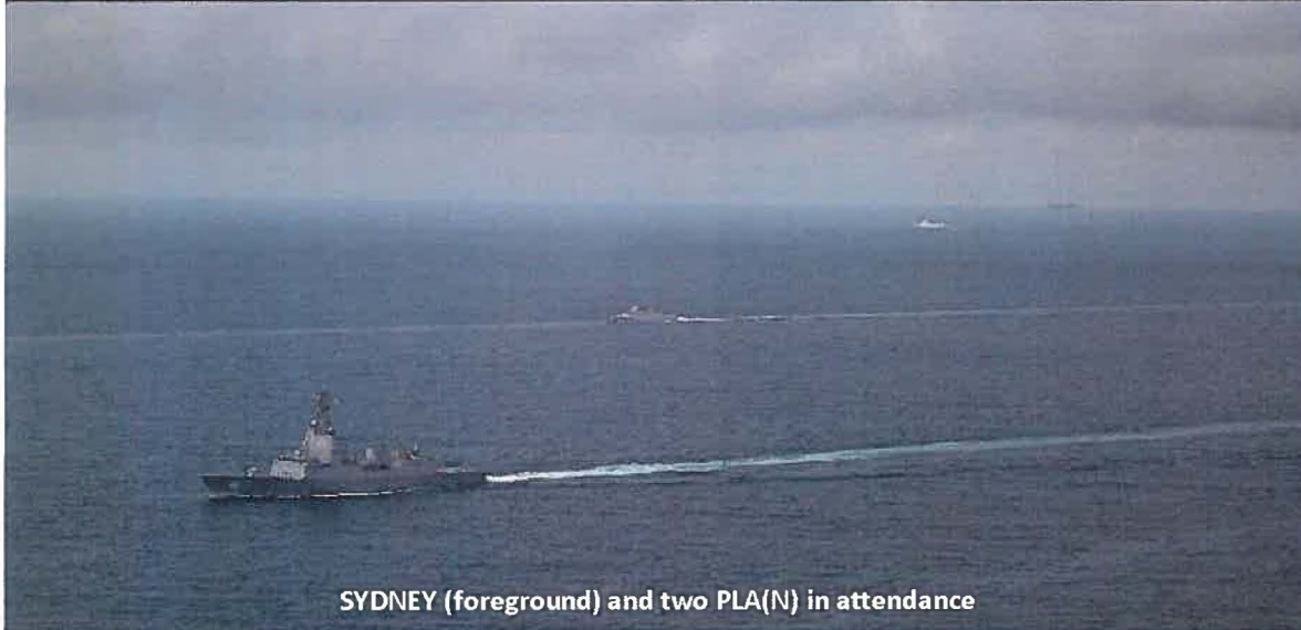
SYDNEY (foreground) and two PLA(N) in attendance