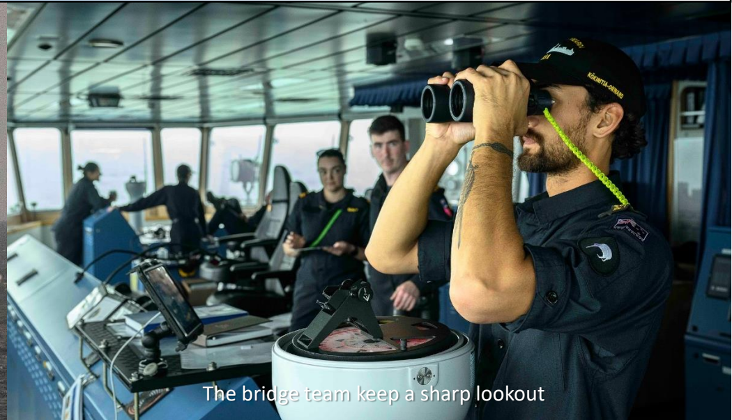
The bridge team keep a sharp lookout