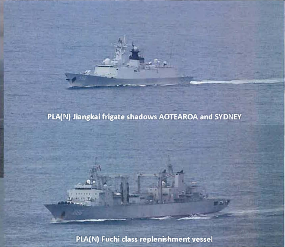
PLA(N) Jiangkai frigate shadows AOTEAROA and SYDNEY