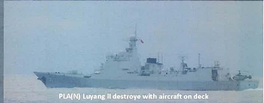
PLA(N) Luyang II destroyer with aircraft on deck