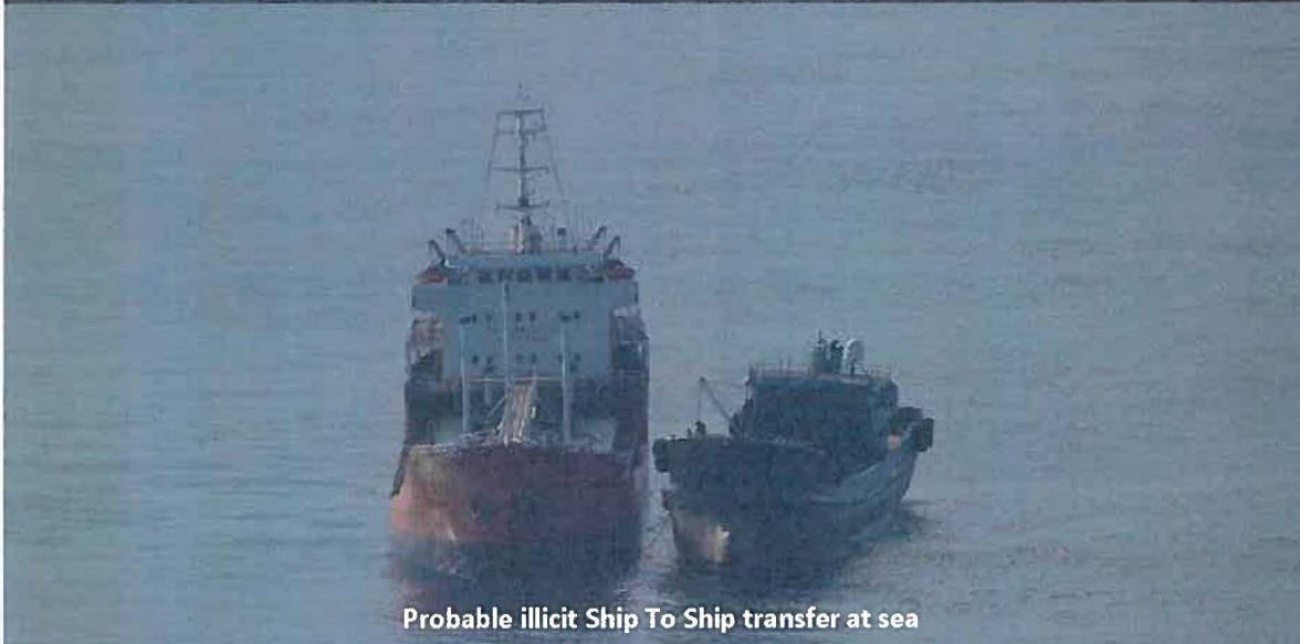
Probable illicit Ship To Ship transfer at sea