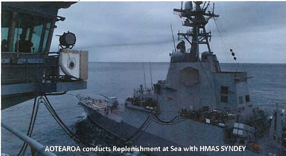
AOTEAROA conducts Replenishment at Sea with HMAS SYDNEY