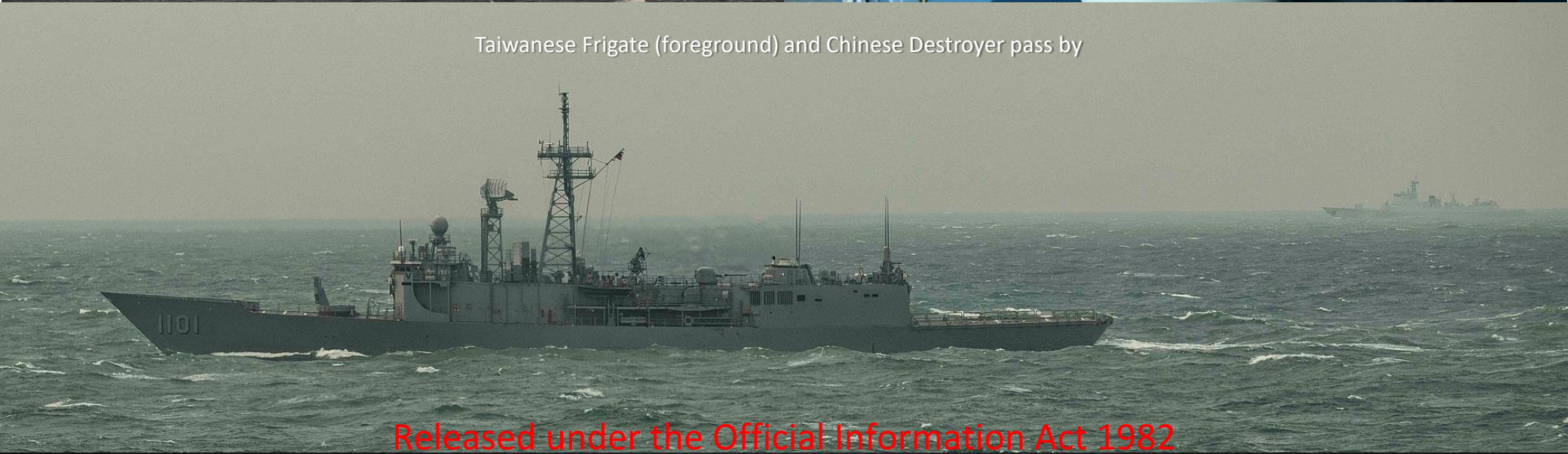
Taiwanese Frigate (foreground) and Chinese Destroyer pass by

Released under the Official Information Act 1982