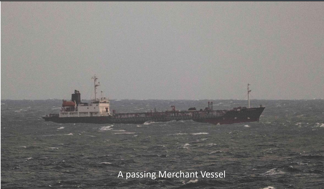
A passing Merchant Vessel