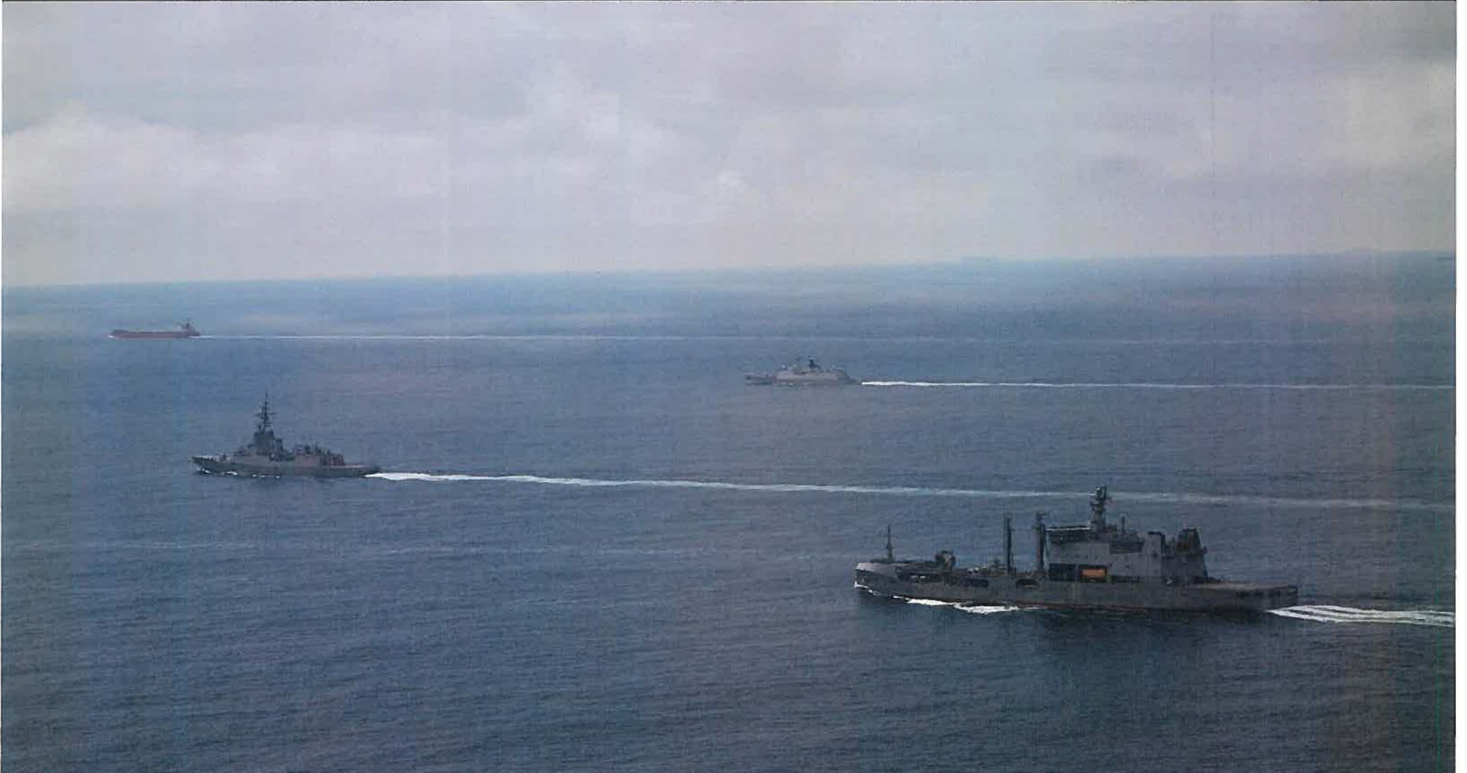
AOTEAROA and SYDNEY conduct Taiwan Strait Transit monitored by a PLA(N) frigate