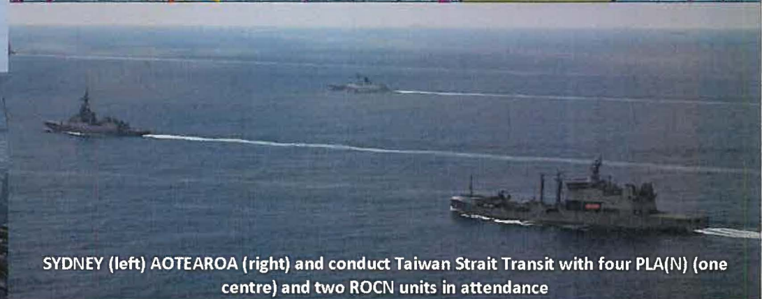
SYDNEY (left) AOTEAROA (right) and conduct Taiwan Strait Transit with four PLA(N) (one centre) and two ROCN units in attendance