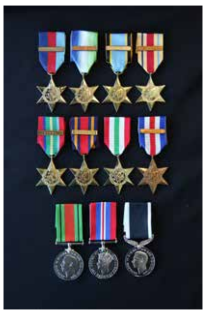
For information on how to apply for medals, visit: Medal applications -New Zealand Defence Force (nzdf.mil.nz)

The NZDF Personnel Archives and Medals team encourages families to enquire about whether medals have been issued. The team routinely checks for outstanding medallic entitlements whenever information is requested from a personal file.