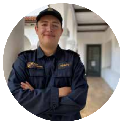
Leading Electronic Technician

https://force4families.mil.nz/massey-university