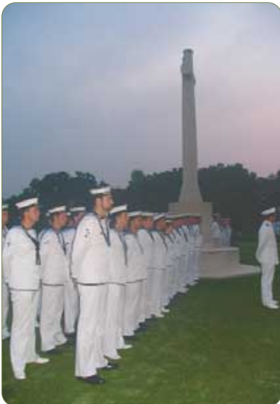
Dawn parade: sailors from HMNZS Te Kaha.

There are some 4,000 war graves at Kranji, while the Roll of Honour names over 24,000 more servicemen and women who have known graves but who fell elsewhere in Southeast Asia.