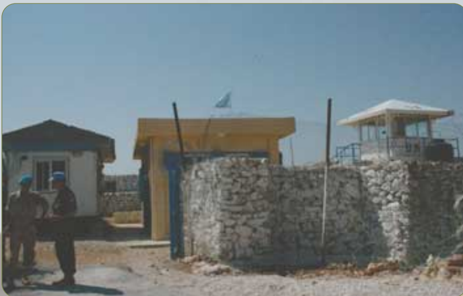
An UNTSO observer post.

The New Zealand Defence Force has contributed peacekeepers to UNTSO since 1954, making it New Zealand's oldest UN mission.