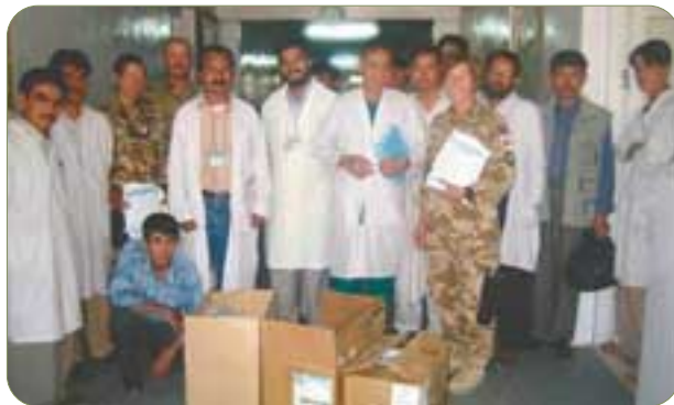
NZDF medical staff with their Bamyan Hospital colleagues take delivery of equipment.

Bamyan hospital is a 60-bed facility that serves as the referral centre for all of the province's health clinics. The