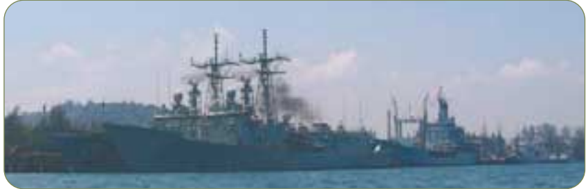
Ships of four nations berthed at Kemaman, Malaysia.

The New Zealand contribution also included the Naval Operational Dive Team and a number of personnel working at the combined headquarters in Penang.